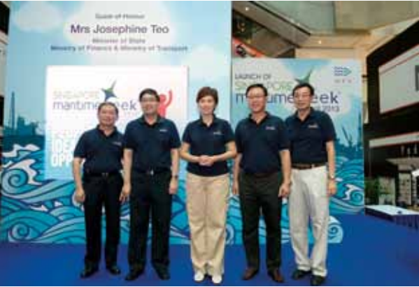
RELATIONS WITH LOCAL BODIES

was held concurrently with the 22nd Asian Shipowners’ Forum, which was held on 20 to 22 May 2013 in Mumbai, India.