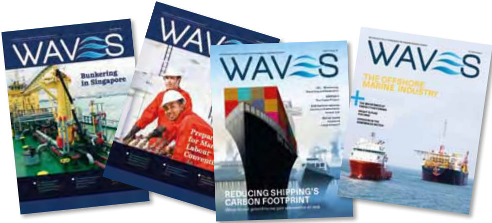
CORPORATE COMMUNICATIONS - QUARTERLY