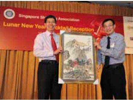
CORPORATE SOCIAL RESPONSIBILITY

School of Management) in Oslo, Norway for a one semester exchange programme during their third year of study.