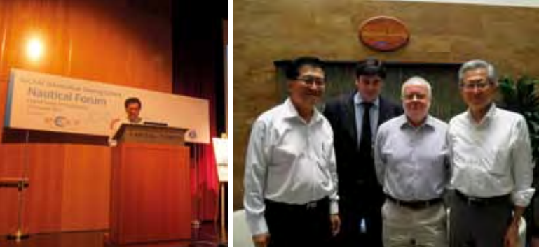
RELATIONS WITH FOREIGN BODIES

Shipowners (INTERCARGO), the International Group of P&I Clubs and the International Association of Classification Societies (IACS).